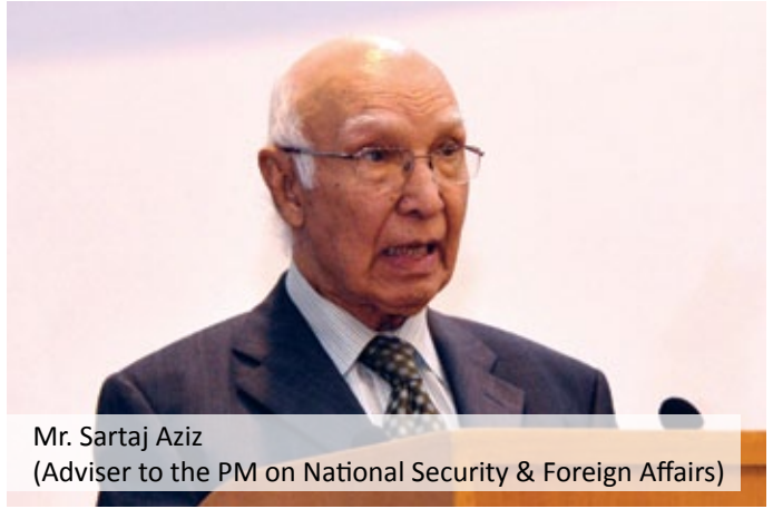
Mr. Sartaj Aziz (Adviser to the PM on National Security & Foreign Affairs)