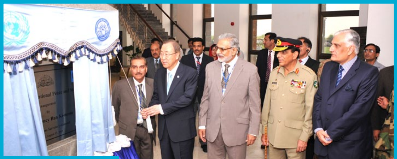
Plaque-unveiling &amp; Ribbon-cutting