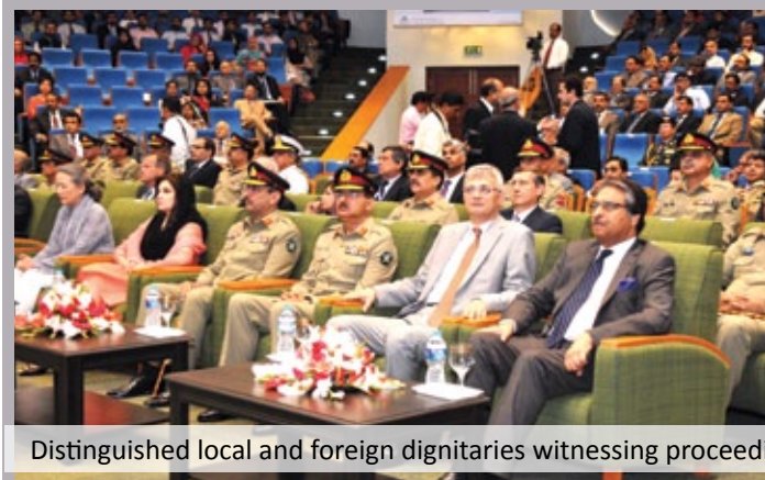
Distinguished local and foreign dignitaries witnessing proceedings of CIPS launch