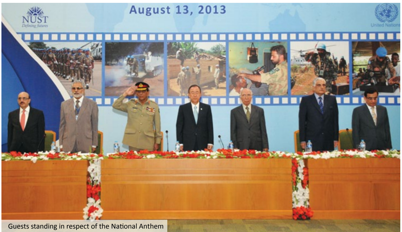
Guests standing in respect of the National Anthem