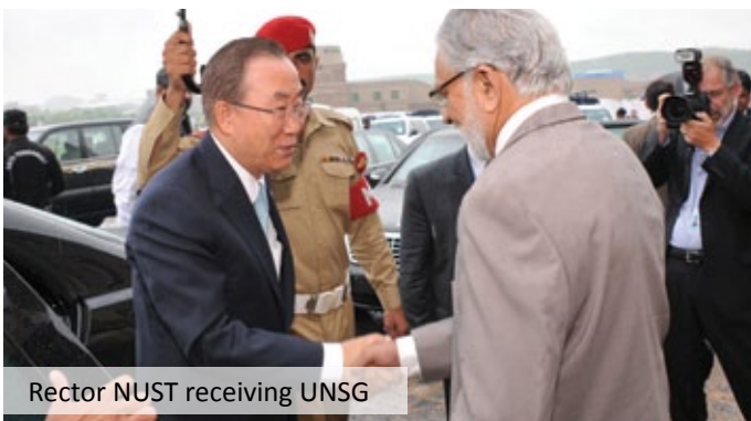
Rector NUST receiving UNSG