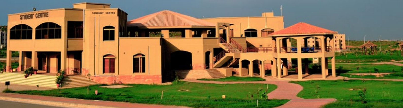
Student Centre, Concordia I