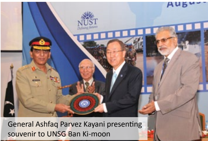
General Ashfaq Parvez Kayani presenting souvenir to UNSG Ban Ki-moon