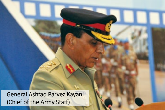
General Ashfaq Parvez Kayani (Chief of the Army Staff)