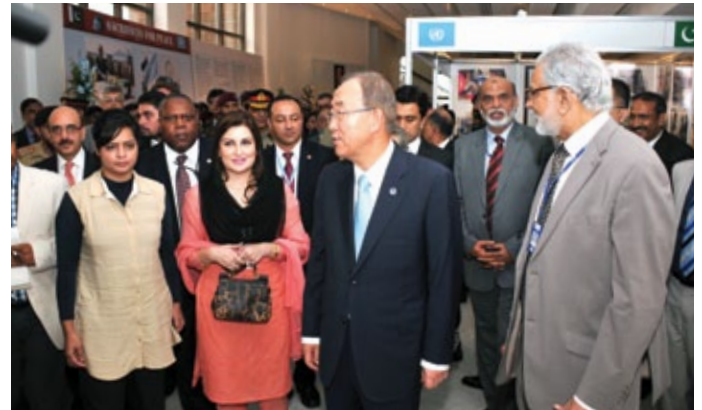
Rector NUST conducting the UNSG and other esteemed guests at the site of Poster Exhibition showing Pakistani peacekeepers at UN missions