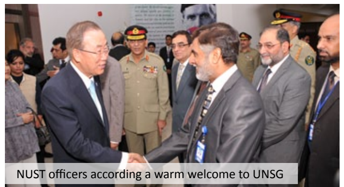
NUST officers according a warm welcome to UNSG