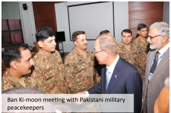
Ban Ki-moon meeting with Pakistani military peacekeepers