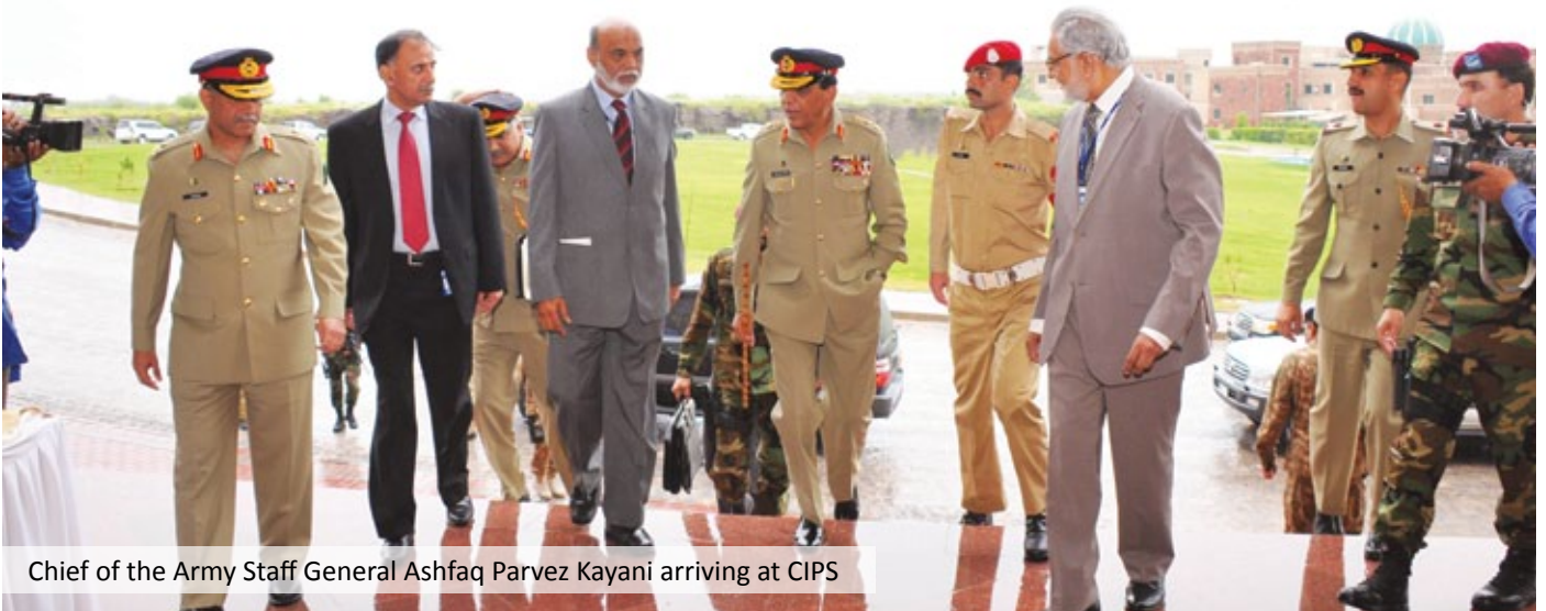
Chief of the Army Staff General Ashfaq Parvez Kayani arriving at CIPS