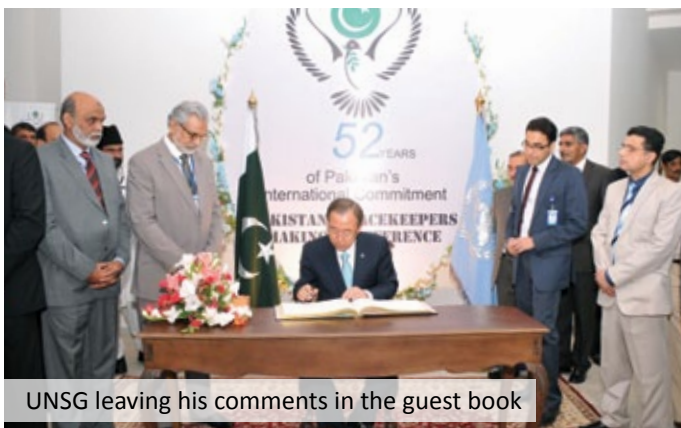
UNSG leaving his comments in the guest book