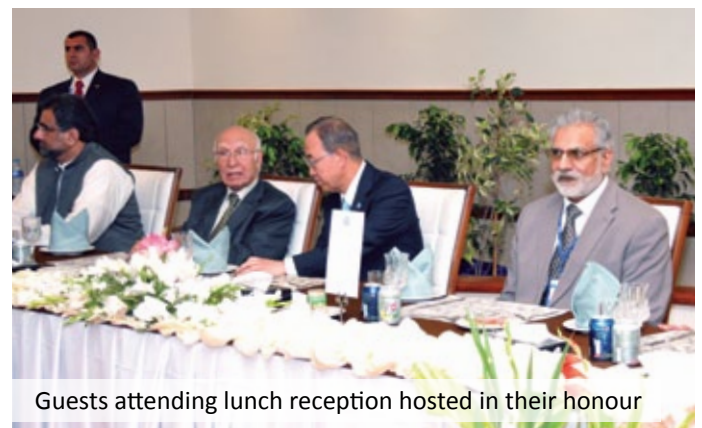
Guests attending lunch reception hosted in their honour