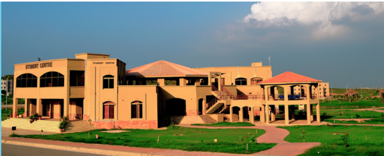
Student Centre, Concordia I