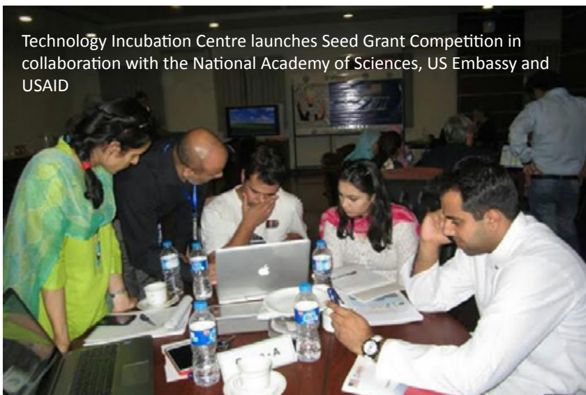
Technology Incubation Centre launches Seed Grant Competition in collaboration with the National Academy of Sciences, US Embassy and USAID