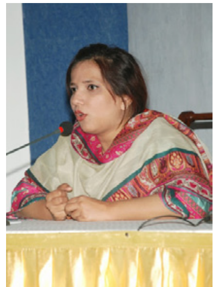
▲ C 3 A conducted an interactive session on "Effective Classroom Management" with faculty of PNEC Karachi.