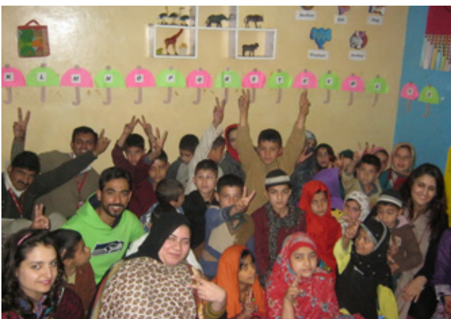
▲ Visit of C 3 A students to drop-in-centre of the Society for the Protection of the Rights of the Child to understand career development issues of street children.