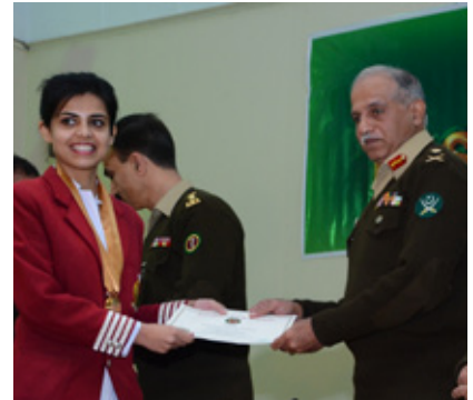
▼ 32nd Medal Distribution Ceremony of the Army Medical College