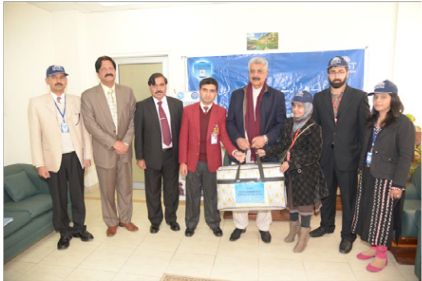
Lt. Gen. (R) Abdul Qadir Baloch, Minister for States and Frontier Regions, with a group of volunteers of NUST IDPs relief campaign. The students presented quilts worth Rs1 million donated by Allied Bank Ltd. to the campaign.