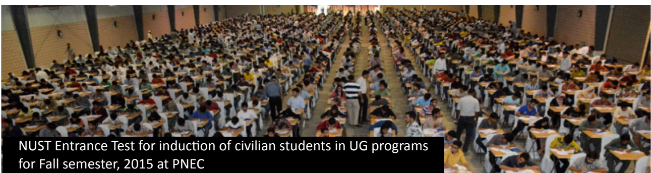
NUST Entrance Test for induction of civilian students in UG programs for Fall semester, 2015 at PNEC