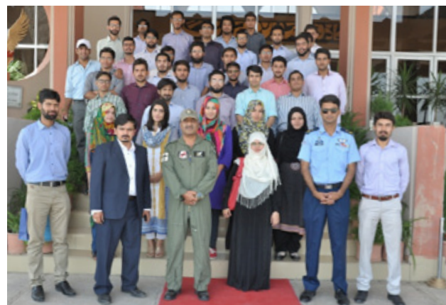
▲ Students from Institute of Space Technology at College of Aeronautical Engineering