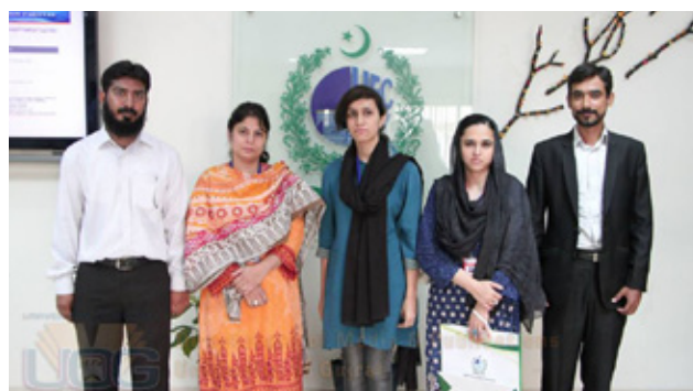
▲ A faculty member and some students of Career Counseling & Education Program participating in one-day symposium “How to develop strong linkages between business, Industry and academics” organized by HEC, Institute of Space Technology and University of Gujrat in August, 2015.