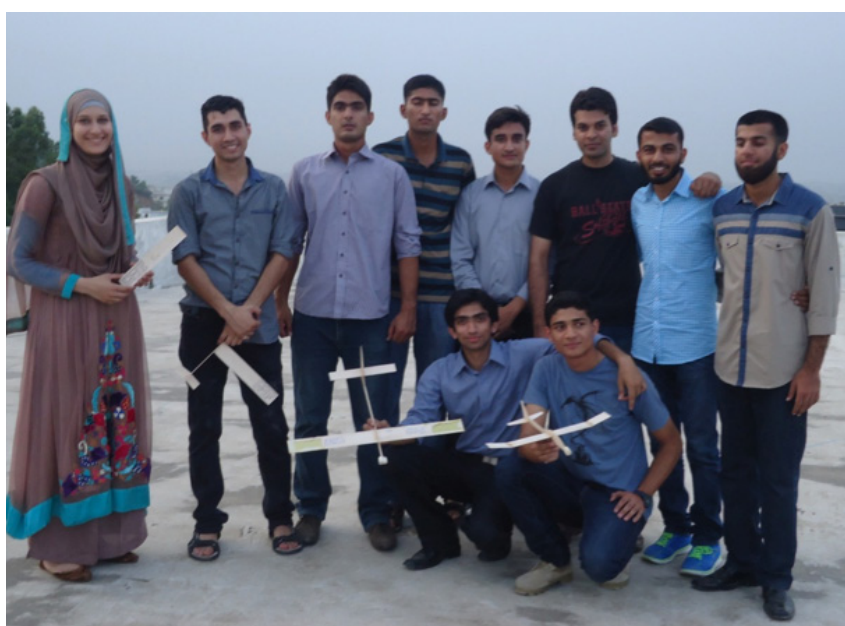
▲ CAE students participating in IST Youth Carnival held recently. Students secured top positions in different categories.