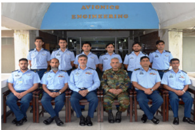
▲ Participants of course on “Matlab Application in Engineering” at College of Aeronautical Engineering