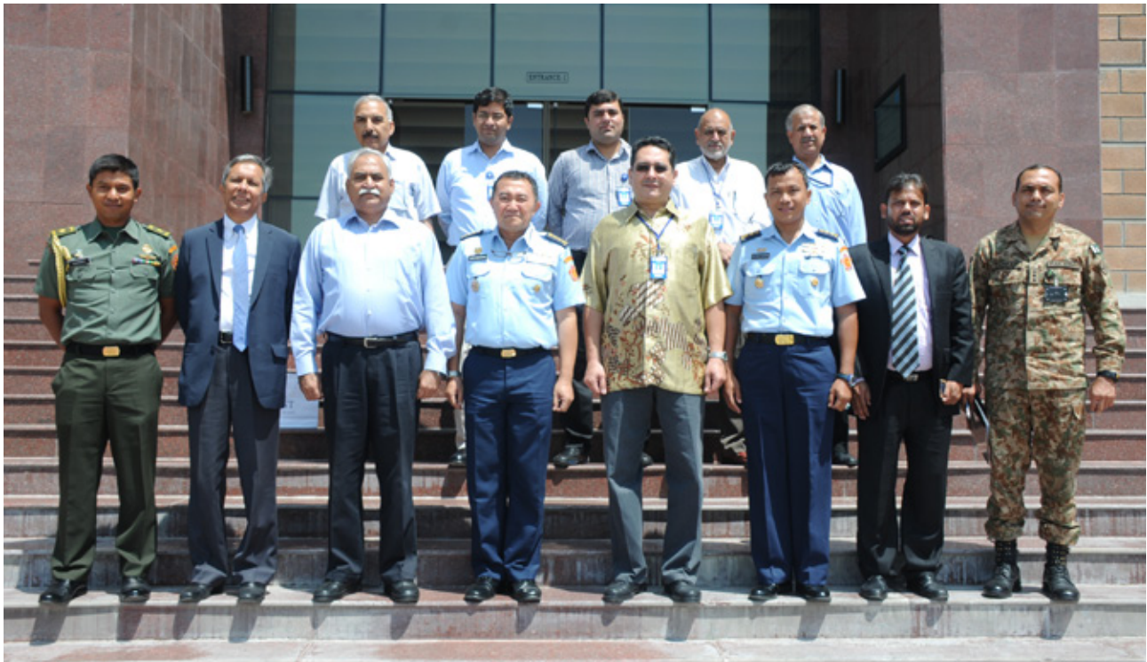
▲ Indonesian Ministry of Defense delegation during its visit to Centre for International Peace and Stability (CIPS) on August 24, 2015.