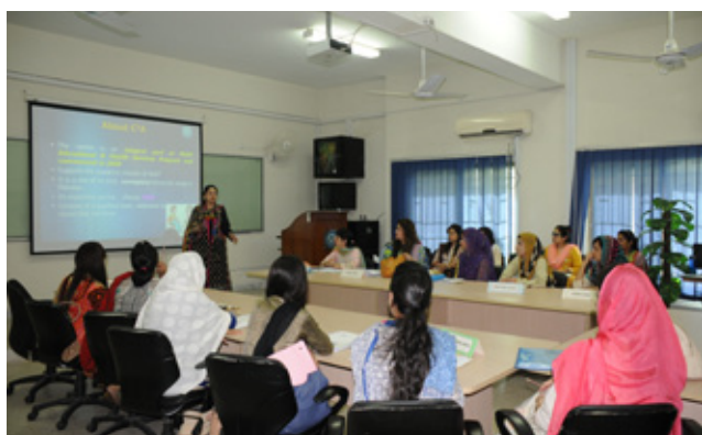
▲ Orientation program for 3rd batch of MS Career Counseling & Education on September 7, 2015