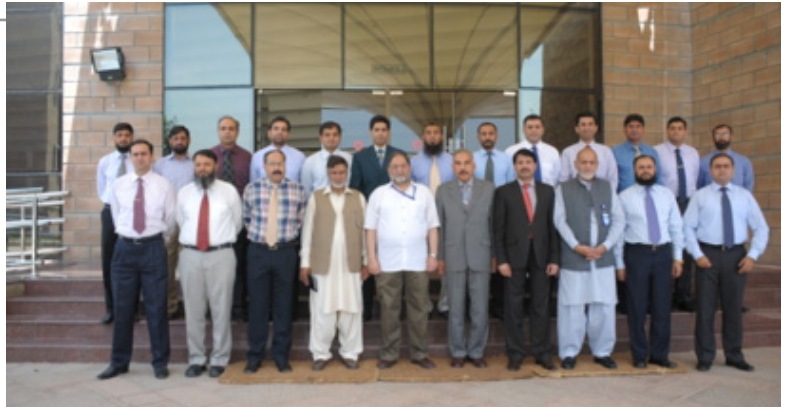
▲ UN Military Observers' and UN Staff Officers' Courses conducted at CIPS - 5 to 16 May.