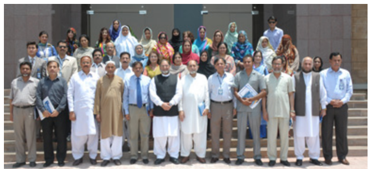
Interactive session with directors, principals of Federal Directorate of Education, Islamabad – 20 June