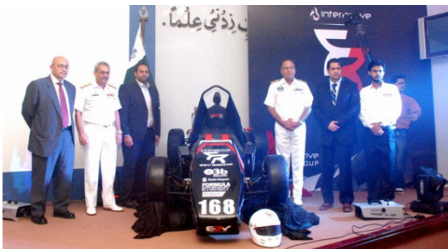
Unveiling of Formula NUST Car (NAS'14) at PNEC - June 10