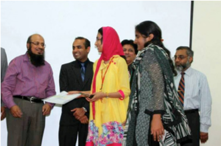
▲ Multi Discipline Event - EMCOT-2014 at COMSATS Institute of Information and Technology – 12-13 May. PNEC won 2nd Position.