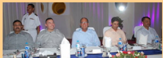
American Naval Officers Dinner at PNS Jauhar- 11 May. Chief of Naval Staff Admiral Muhammad Asif Sandila also graced the occasion with his presence.