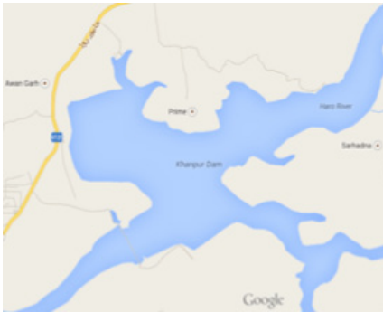
Khanpur Dam by NICE ▶ students - 7 May