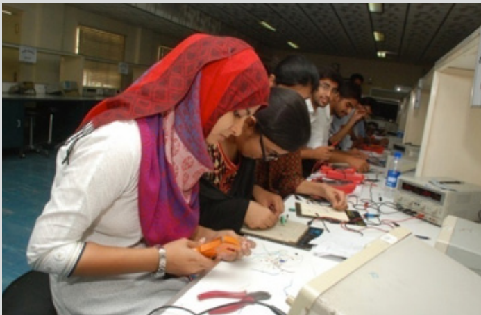
▲ PEC team accreditation visit, PNEC – 13 May