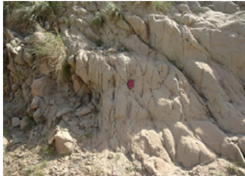
◀ NICE students visit Daducha Village for dam site geological investigation- 29 April