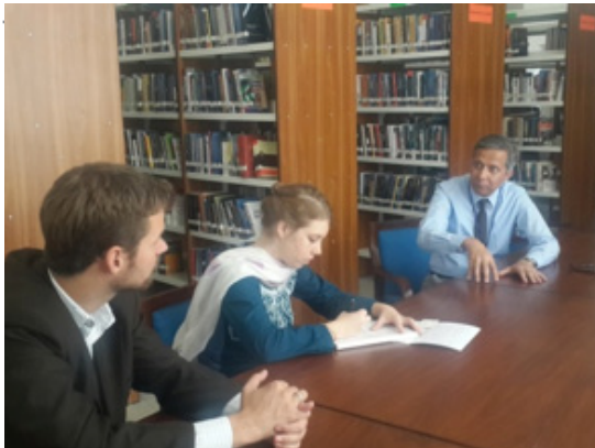
▲ CIPS faculty meets with Hanns Seidel Foundation delegation at NUST HQ – 22 May