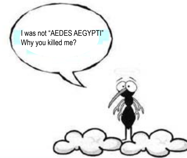
To Whom it May Concerns